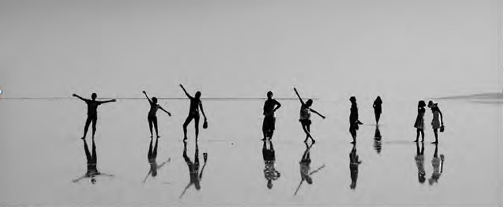
Houssein Kazma's photo was one of the winning photos in 1000Kalema, a contest run by URI CCs Think Peace International and Naya CC.